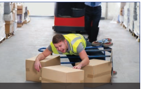
How did that happen?