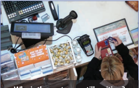
Why is the customer still waiting?