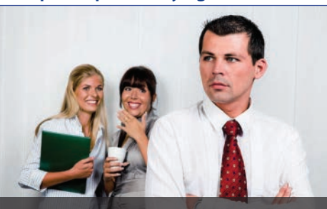
How long has that been going on?